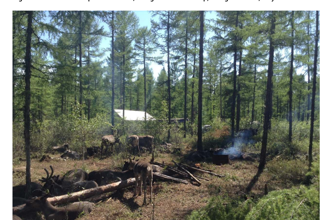
Figure 2. A summer camp with reindeer, Pelagiia summer camp, Alongshan area, July 2016

The dwellings are diverse, differentiated by various terms and languages. The conical tent (djiu in Evenki, which also designates the household) is referred to via the Russian word meaning "tent" (palatka) by the Evenki and serves mainly as food store or a place for tourists to sleep. The modern rectangular tent (zhangpeng 帐篷 in Chinese) is the main living space during the summer months. Since 2013-2014, a third type of dwelling has been provided for free by the local government of Aoluguya to Evenki herders: a tent-covered truck (Ch. pengche 篷车) used during the winter¹9. In addition, the camp consists of a collective reindeer enclosure, a platform owned by each family for the storage of belongings (Evk. engnewun, Ch. cangku 仓库), a solar panel, a kennel for dogs and, for some families, a reserve of hay during winter.