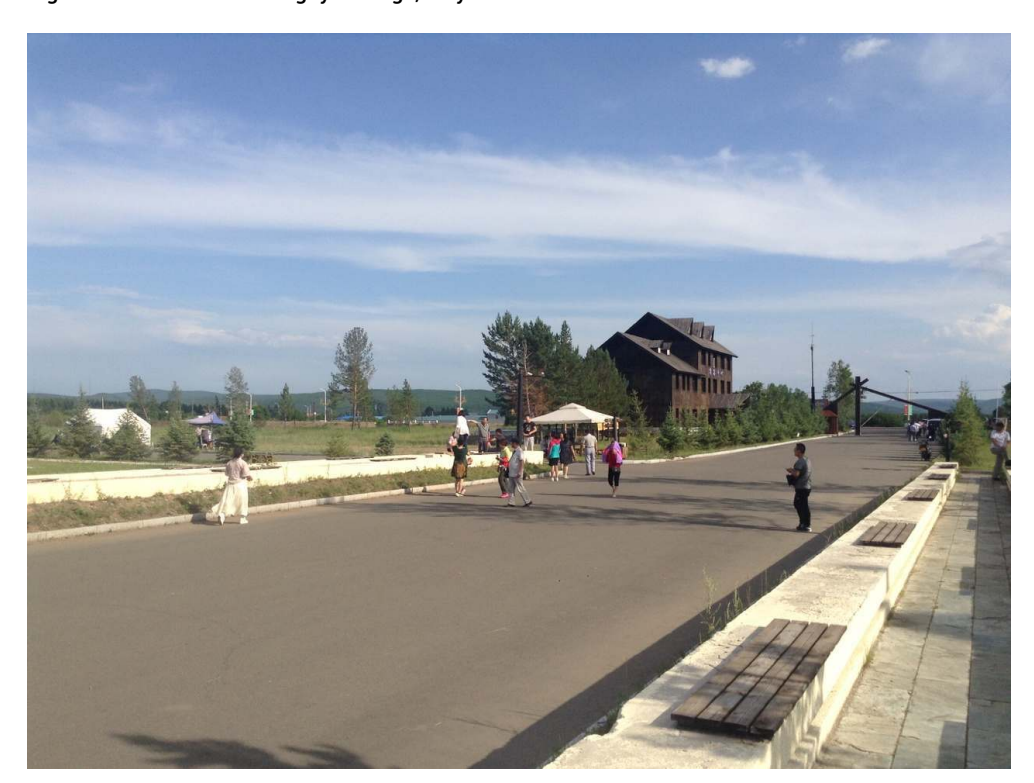
Figure 1. Main road of Aoluguya Village, July 2016