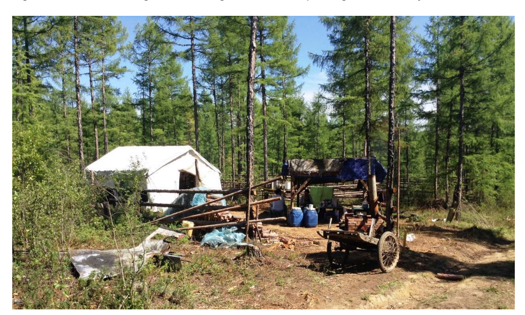
Figure 3. A modern rectangular tent, Pelagiia summer camp, Alongshan area, July 2016

© Aurore Dumont, Alongshan area, July 2016