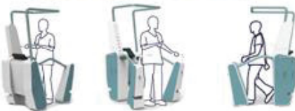
Figure 3: The gait rehabilitation robot

2. An innovation that respects ethical principles (e.g. non-stigmatisation of the patient) or the recommendations of medical bodies concerning gait rehabilitation practices (e.g. the continuous presence of the physiotherapist, the