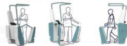
Figure 3: The gait rehabilitation robot (source: https://ba-healthcare.com/ )

2. An innovation that respects ethical principles (e.g. non-stigmatisation of the patient) or the recommendations of medical bodies concerning gait rehabilitation practices (e.g. the continuous presence of the physiotherapist, the