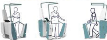
Figure 3: The gait rehabilitation robot

2. An innovation that respects ethical principles (e.g. non-stigmatisation of the patient) or the recommendations of medical bodies concerning gait rehabilitation practices (e.g. the continuous presence of the physiotherapist, the