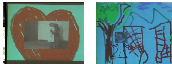
Figure 2a and 2b: POGO staging and composing a narrative

a) Gathering, recording, and layering: POGO enables a found-art approach to creating personally meaningful narratives (without being limited to components pre-selected and predefined by the system). The children are encouraged to feed their favorite ‘ready-mades’ or personal creations into the tool (ex: a token-object, picture, recorded sound, document, drawing,), and the tool “responds” by projecting (magnifying) the entries, and letting the children overlay, annotate, configure, assemble, and ultimately sequence chosen components (their gifts) into a growing narration. The tool augments their gifts by offering a projection and editing suite (French: une table de montage )