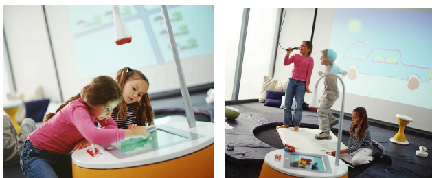
Figure 1a and 1b: POGO with beamer and general view.

POGO 1 enables children to compose their own stories and “upload” them onto a durable support, or medium. The environment was designed to bridge a virtual story-world with POGO “active tools” to enable the creation and manipulation of story elements through physical experience. Said otherwise, a virtual world incorporates everyday objects via digital media, and relies on the child's physical environment and sensory modalities. The functionality of the tools span over many areas: gestural (live performances), visual (images and drawings), aural (sounds and atmospheres), manipulative (physical feedback) and material (physical objects). Although the system is computer-based, the standard interface of keyboard, screen and mouse has been replaced with a far more intuitive one..