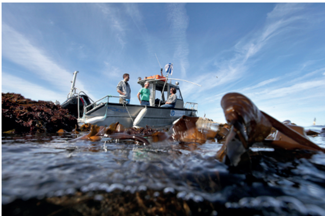
Figure 2. A field campaign of measurements of the emissions of volatile molecular iodine ( I_2 ) during the low tide over a kelp bed dominated by Laminaria digitata . The Aurelia research vessel is equipped with a spectrometer that use broadband cavity enhanced absorption spectroscopy to quantify iodine in the gas phase. This site for kelp studies is located at Pointe Sainte Barbe at Roscoff.

possibility of cultivating these algae massively after the second world war in the world's leading production of marine plants in China. Today, the Center for Marine Biological Resources ensures with research teams, the conservation of strains and support for genetic work on European species of kelps ( https://www.embrc-france.fr/en/recherche-et-developpement/marine-biological-resources ).