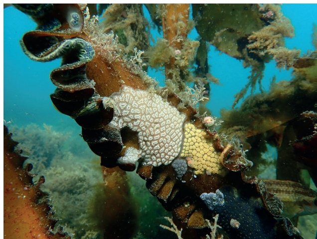
Figure 1. The luxuriance of the kelp associated biodiversity at Perharidy Point in August 2022 showing at the surface of Sacchoriza polyschides the colonies of botrylloid ascidians as beautiful as a painting from Mathurin Meheut one century before.