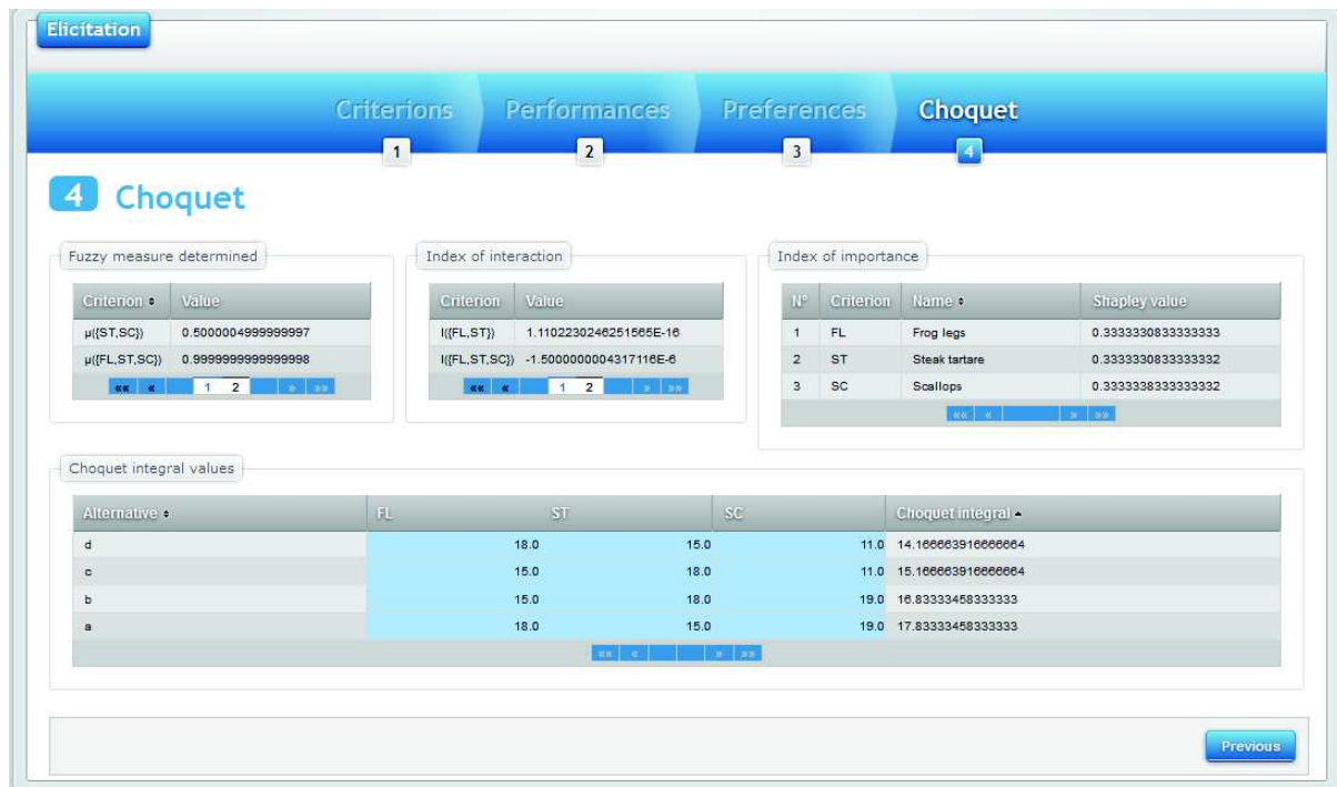
Figure 4: Results of the example of the four chefs

Results: one can easily check that the decision maker's preferences were taken into account. The system we implemented obtained the same final ranking, A \geq B \geq C \geq D .