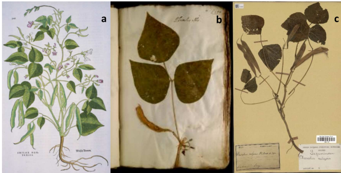
Figure 1. Example of Herbaria evolution over time. (a) The oldest Illustration of an European Common Bean plant ( Phaseolus vulgaris ) from “ Di Historias Stirpium ” (Fuchs, 1542); “Courtesy of Hunt Institute for Botanical Documentation, Carnegie Mellon University, Pittsburgh, PA”. (b) Phaseolus vulgaris specimen from the herbarium of Ulisse Aldrovandi; “Courtesy of Alma Mater Studiorum University of Bologna—University Museum System—Herbarium and Botanical Garden”. (c) Phaseolus vulgaris specimen from the Muséum National d’Histoire Naturelle (MNHN) in Paris dated 1833. The label notes include information about the collector and the collection site and the date.