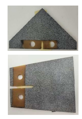
Fig. 1 – Experimental set-up under quasi-static loading.