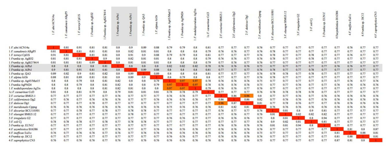
Figure 2. Heatmap matrix of Average Nucleotide Identity (ANI) comparisons for the Frankia genomes of strains and type strains of described species using the pyani platform with the b (Blast) setting [38]; https://pyani.readthedocs.io). The two genomes described in the present study are highlighted in grey.

other Alnus -infective cluster 1 strains (Table 2 and 3). These data include high number of T1PKS and NRPS (Table 3) as well as transcriptional regulators such as ArsR, and LuxR (Table 4). Additional comparisons with cluster 2, 3 and 4 frankiae are provided in Supplemental tables S2, S3, and S4. A search for genes present in F. alni ACN14a, Frankia sp. QA3, F. torreyi CpI1 and F. canadensis ARgP5 but absent in AiPa1 and AiPs1 yielded 475 or 112 hits, respectively among which a hup cluster and a dipeptide transporter in AiPa1, and the gvp cluster in AiPs1 (Table S5).