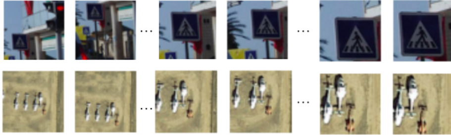
Fig. 2. Examples of images at different parameter transformation in the two considered datasets. From left to right: Scale 1, 3, 23, 25, 45 and 47. Training is done considering only images of intermediate scales (17 to 32) in both training and validation. Evaluation is performed on both small (0 to 16) and large (33-48) scales. In first row: An example of Traffic Sign dataset. In second row: An example of Aerial dataset.