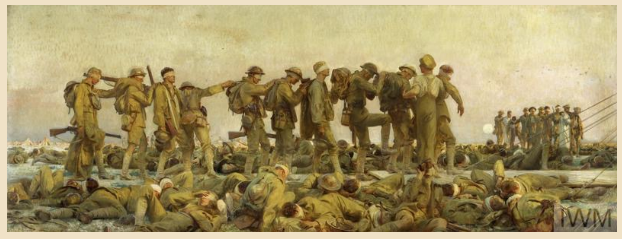
John Singer Sargent, Gassed (1918-19)

The world's first major industrial warfare ravaged the male body but also restored tenderness to touch in male relationships (Das 4).