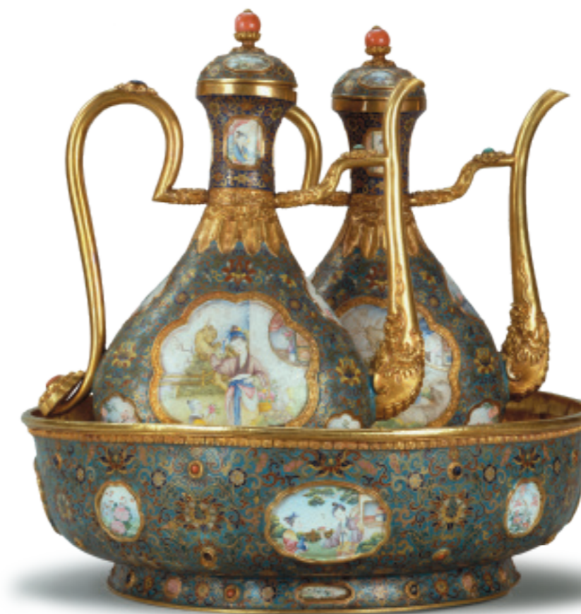
Fig. 1 Two piriform ewers and basin with Qianlong reign mark China; Qing dynasty, Qianlong period (1736–95) Gold core, cloisonné, painted enamel, gilding, coral, turquoise, lapis lazuli; ewers h. 38 cm, basin h. 13 cm x d. 41 cm Chinese Museum, Château de Fontainebleau, France

For his sixtieth birthday in 1716, the Kangxi emperor received from Canton a box of European colours for the production of enamels at court. This unusual gift is deeply meaningful. The Kangxi emperor was known for his curiosity for European science and for clocks, of which he had more than 2,000 in his personal collection. The Manchu monarch was not satisfied with simply enjoying the flattering and enticing goods from overseas; he was also interested in the materials and technical processes involved in their manufacture. In addition to European colour pigments, blocks of enamel and glass, oil of toluene, and tools were brought to the Kangxi court for the production of painted enamel, which took place in various imperial workshops: the French church Beitang, the Palace of Military