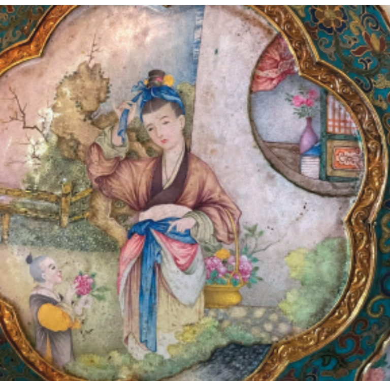
Fig. 2 Detail view of a lobed cartouche on an ewer, showing a lady in the chinoiserie style China; Qing dynasty, Qianlong period (1736–95) Cloisonné, painted enamel Chinese Museum, Château de Fontainebleau (F 1467 C.2 Aiguière)

and technique equivalent or even superior to those produced in Europe. The appropriation of European painted-enamel techniques in the early 18th century was not a simple issue of technical advancement but rather a critical step in a larger cultural strategy to legitimize the Kangxi emperor's aspirations to be a universal monarch.