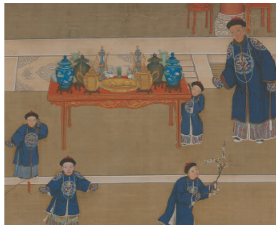
Fig. 6 Detail view of Celebrating Empress Dowager Chongqing's Eightieth Birthday By Yao Wenhan (act. 1740s–70s), Zhou Ben (act. 1760s–70s), and Yi Lantai (act. 1748–86); 1771–72 Ink and colour on silk The Palace Museum, Beijing (Gu 6541)

on porcelain and copper for the European and Islamic markets. The pair of ewers and the single basin currently kept at the Chinese Museum of the Château de Fontainebleau reveal the indirect influence of the 'Western seas' commands issued by the Chinese court via Canton. The term 'Western seas' must be understood in a broad geographical sense, associating in a single concept Europe and the Muslim world, especially India. In fact, from the 16th century onwards, Europeans took over the regional Southeast Asian trading networks (mainly maritime) that had long been shaped by multipartner interactions. The impact of these complex cultural, visual, and material exchanges is evident in another piriform ewer, this one smaller in size (Fig. 4). The same kind of scene, described as 'lady and child', can be found here on the central painted enamel medallions but in a totally European style. The patterns and colours of the cloisonné enamel work used for the ground reflect the Mughal influence.