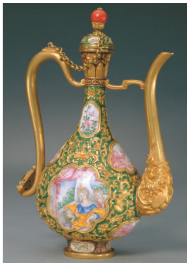
Fig. 4 Piriform ewer with scene of a lady and boy in European style China; Qing dynasty, Qianlong period (1736–95) Gold core, cloisonné, painted enamel; h. 18.8 cm Palace Museum, Beijing (Gu 11461)

In this first group of exceptional items, three shapes are recorded: four pieces of the piriform shape, two pieces of the cylindrical duomu shape, and one piece of the combined square-piriform shape. Three of the four piriform ewers are almost identical in shape, decoration, and dimensions (height 38 cm). Two of them are kept at the museum of the Château de Fontainebleau that holds the collection of Napoleon III and the empress Eugenie, while the third example is part of the collection of the Palace Museum in Beijing. The piriform ewer shape with a long narrow neck and round belly was likely inspired by Central Asian silver ewers, probably originating from Bactria, a Central Asian region that spans modern Afghanistan, Tajikistan, and Uzbekistan. First brought to China in the 7th century during the Tang dynasty (618–907), this shape enjoyed a revival