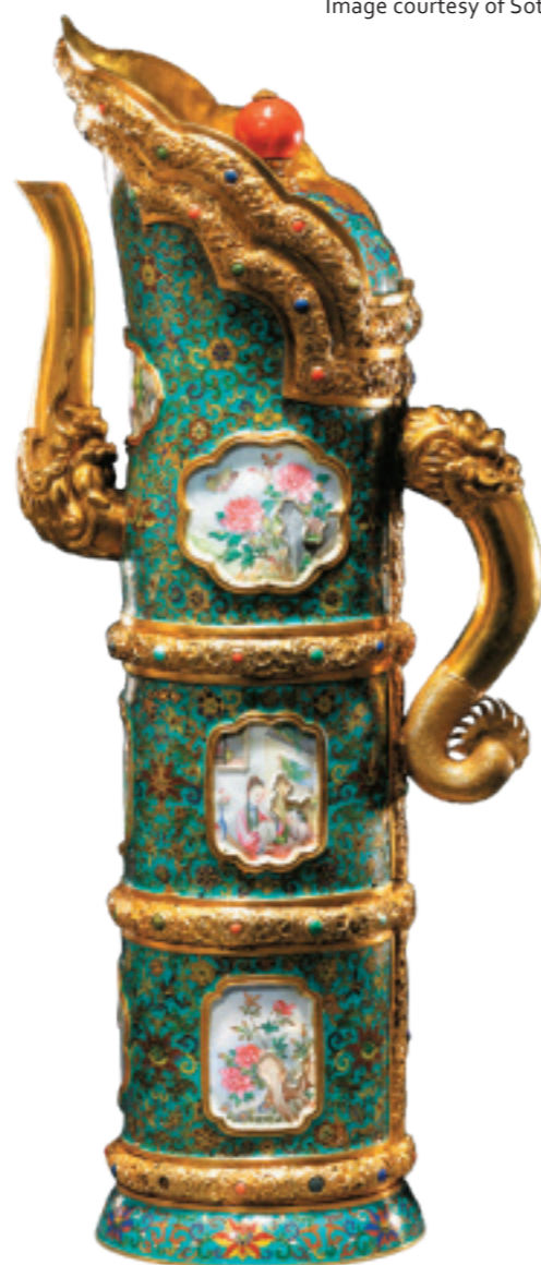
Fig. 5 Duomu -shape ewer China; Qing dynasty, Qianlong period (1736–95) Gold core, cloisonné, painted enamel, gilding, coral, turquoise, lapis lazuli; h. 29 cm

In the Islamic world, this shape, often paired with a basin, was found in the metalwork of Khorasan in northern Iran at the end of the 12th century. The ewer-and-basin set was subsequently introduced into Europe as an everyday toiletry luxury item and is included in Canton's repertoire of enamels