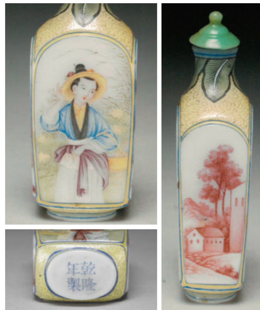
Fig. 3 Snuff bottle with figural images in chinoiserie style and European landscapes China; Qing dynasty, Qianlong period (1736–95) Glass, painted enamel; h. 7 cm National Palace Museum, Taipei (Guci 017629)

Similar chinoiserie can be found in Canton's copper and porcelain enamels produced for European markets. The available evidence points to Canton as one of the main channels that introduced the fashion for chinoiserie at the Qianlong court.