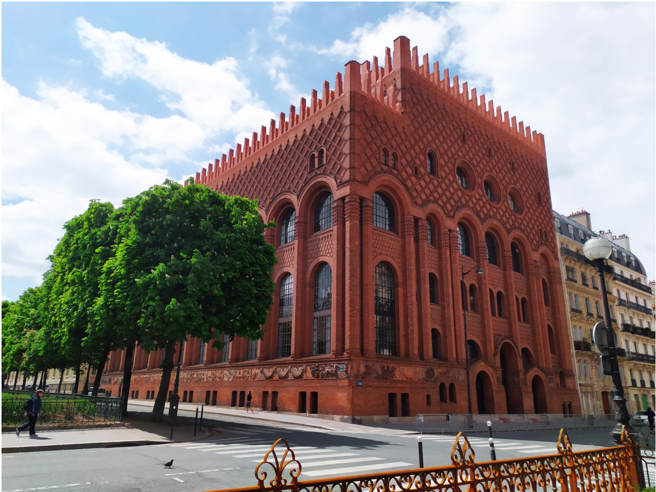
Fig. 2 – The Institut d'art et d'archéologie. Université Paris 1 Panthéon-Sorbonne

When the building opened in 1932, the 400 or so students who were to attend courses in archaeology and art history were immersed in an atmosphere of erudition, which included not only the classrooms, but also, and even more so, a cast museum and exhibition galleries, various archaeological collections, a photo archive containing tens of thousands of prints and glass plates, and several research libraries, including the Jacques Doucet's art and archaeology library. This library was then (and still is today) the largest in France in the field, although it is now housed in the former locale of the Bibliothèque nationale . These remarkable study conditions were accompanied by a cultural program—concerts were given every week in the large auditorium in the basement—and the institution came to enjoy an international influence. The course offering was widely distributed, while summer schools enabled professors based in Paris to attract American students and disseminate their knowledge across the Atlantic. In its conception, the Institut d'art et d'archéologie was not only a facility for teaching; according to the principles that led to its construction, it was to be a laboratory, a place for “science in the making.”