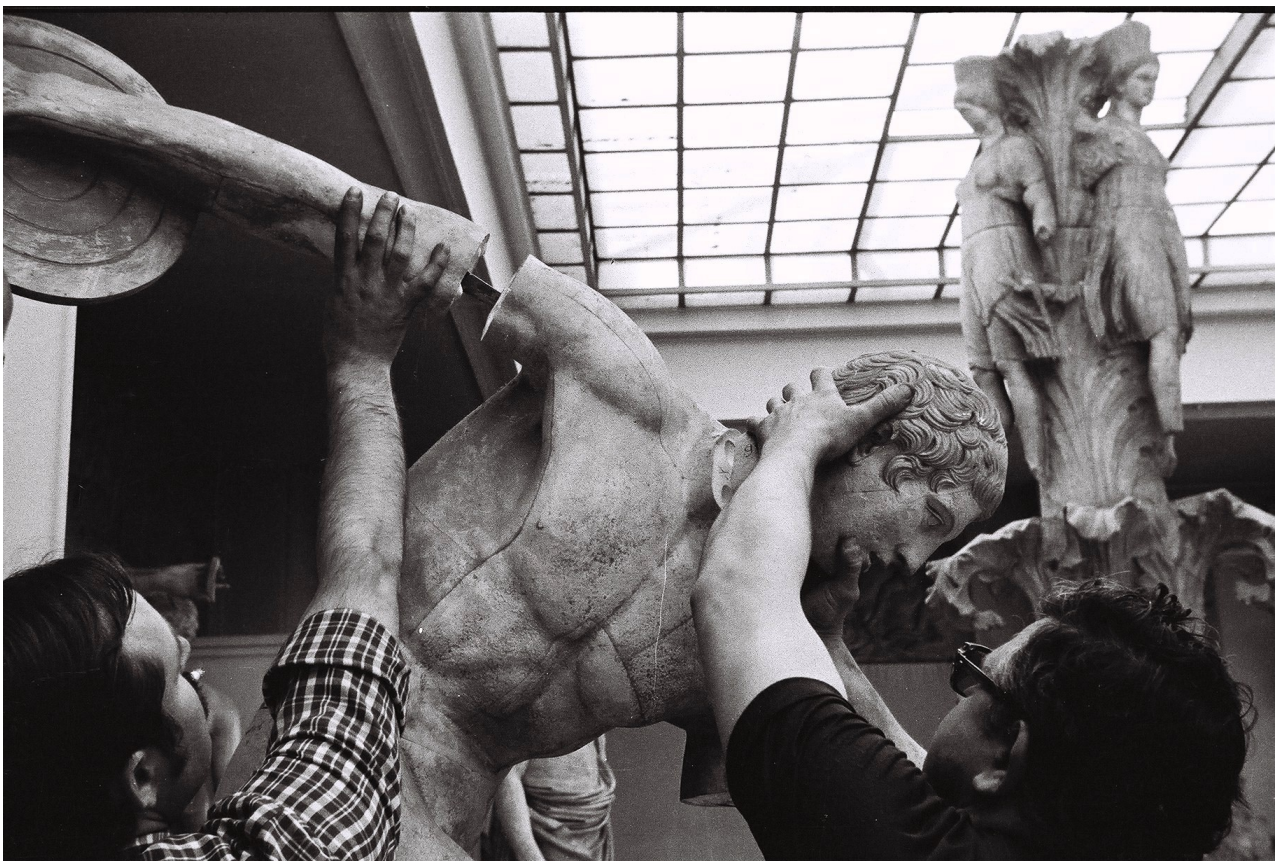
Fig. 4 – Dismantlement of the cast gallery, July 1973.