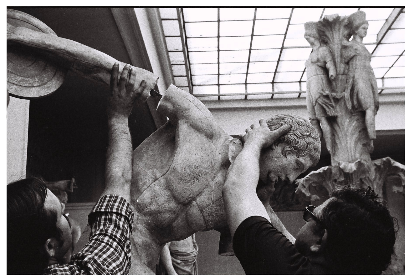
Fig. 4 – Dismantlement of the cast gallery, July 1973.