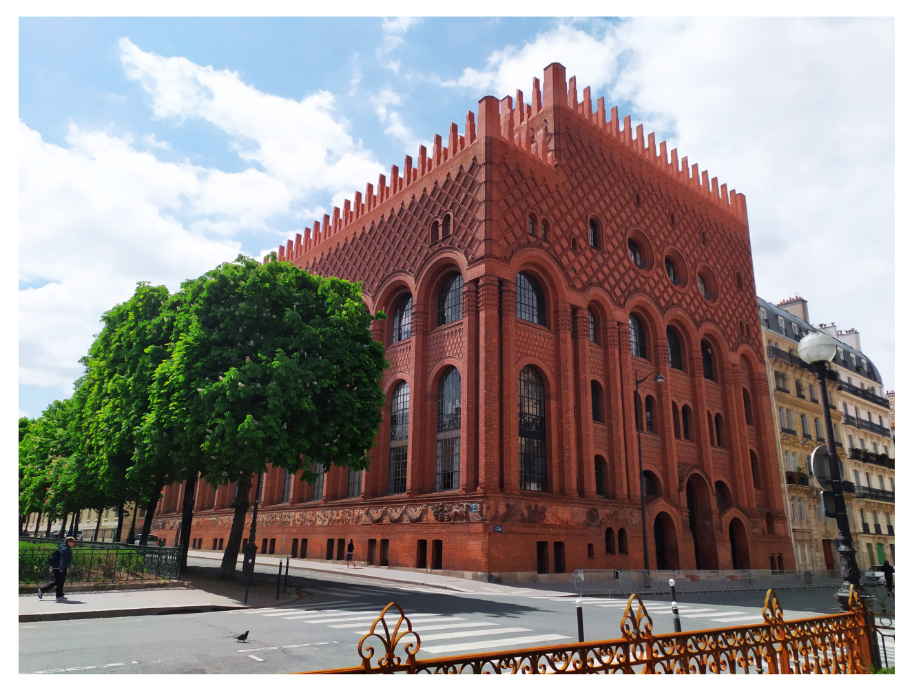
Fig. 2 – The Institut d'art et d'archéologie. Université Paris 1 Panthéon-Sorbonne

When the building opened in 1932, the 400 or so students who were to attend courses in archaeology and art history were immersed in an atmosphere of erudition, which included not only the classrooms, but also, and even more so, a cast museum and exhibition galleries, various archaeological collections, a photo archive containing tens of thousands of prints and glass plates, and several research libraries, including the Jacques Doucet's art and archaeology library. This library was then (and still is today) the largest in France in the field, although it is now housed in the former locale of the Bilbiothèque nationale . These remarkable study conditions were accompanied by a cultural program—concerts were given every week in the large auditorium in the basement—and the institution came to enjoy an international influence. The course offering was widely distributed, while summer schools enabled professors based in Paris to attract American students and disseminate their knowledge across the Atlantic. In its conception, the Institut d'art et d'archéologie was not only a facility for teaching; according to the principles that led to its construction, it was to be a laboratory, a place for "science in the making."