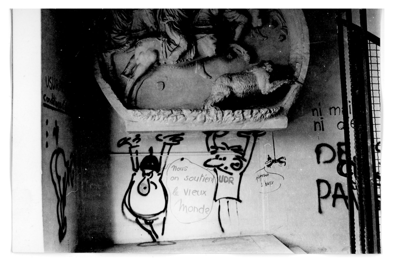
Fig. 3 – May 68 graffito in the staircase of the Institut d'art et d'archéologie.

an ever-growing population of students. Then came the events of May 1968. Amidst the student and social insurrection, the building and its collections suffered enormously: many plaster casts were vandalized or destroyed, while the walls of the institute were stained with graffiti when the students involved in the movement chose the building as a meeting place for its action committees, as shown in photographs taken by Jo Schnapp during the second half of May (fig. 3). Virtually besieged by the Compagnies républicaines de sécurité (CRS, a section of the French National Police responsible for crowd and riot control), the stained staircase and upper floor of the building, as if echoing the insurrectionary charge of the slogans deployed in the streets, showed another facet of the May 68 movement (see Lewino 2018, with Jo Schnapp's photos). Indeed, beyond the punctual material degradations, the splitting of the University of Paris into thirteen universities marked the real turning point in the teaching and scientific project of the Institut d'art et d'archéologie .