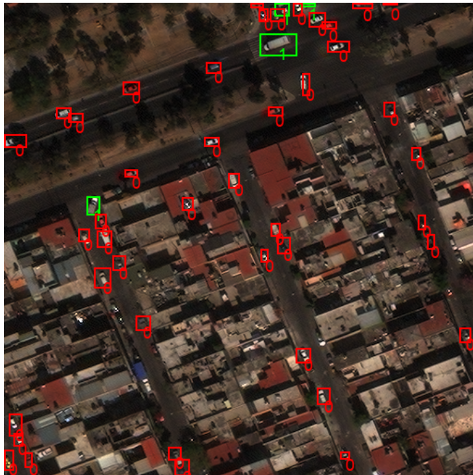
Figure 2: Illustration of the object detection task on xView Dataset. Cars are in red and correspond to class 0, Trucks are in green and correspond to class 1.