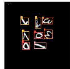
(b) Image from OD-MNIST test set