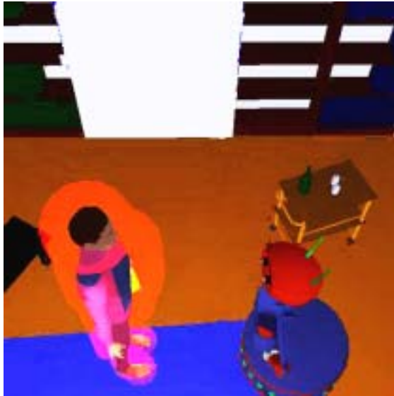
Figure 1: safety distances. Virtual “bubbles” surround the human.

collide with the suit, and therefore keep the human body out of robot reach (figure 2).