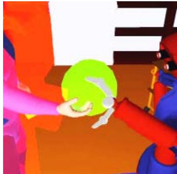
Figure 4: An exchange zone related to the human manipulation model is defined for direct interaction.

the constraint of the safety distance. However, a closer safety distance is then defined to forbid direct contact (figure 5). For object exchange, the safety region can be defined closer to the human body. We can note that in such exchanges, the robot motions are more local and slower.