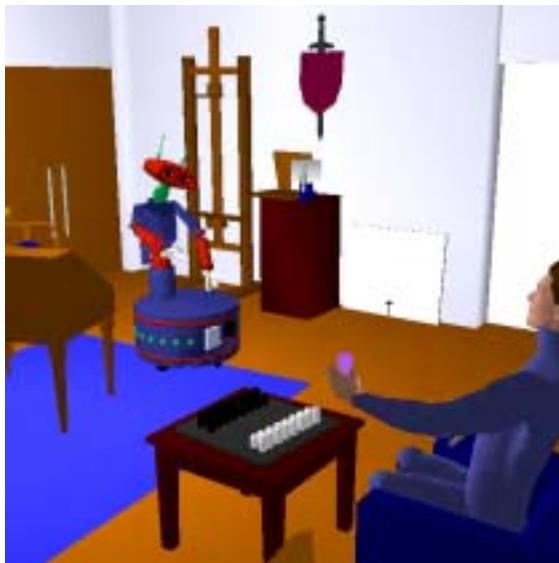
Figure 6: Even if the robot has gesture recognition capacities the glass is shown for service), it must produce also understandable motions in cluttered environments.

a model of human communication behavior . For example, when the robot speaks to the human it is more adequate to face him or her at, or when it must hand something to him/her, it is again better that the robot comes to face the human, even if this requires it to avoid obstacles or to plan a complex motion [10]. The robot should be endowed with a human communication model defining its capacities and adapted to the human which the robot interacts with (e.g, handicapped or not). Figure 6 shows an example of robot reaction when understanding the human “calling” gesture requiring a service from the robot.