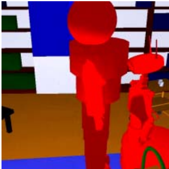
Figure 3: The forbidden distance represents the human intimate distance. The robot must move away when in contact with it.

robot is similar to the interaction with other humans, i.e., through speech, vision and touch, then such distance will be very natural to the human. Our purpose is to make them also natural for the robot. Hence, when a robot must listen to a human or speak to him or her, or when it moves along the human or when a human approaches the robots (figure 3) etc., it must be always keep the adequate distance. Again, distance checking in the robot motion planning and control system plays a central role.