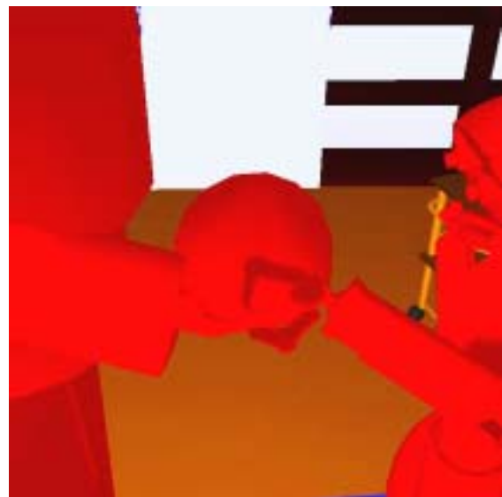
Figure 5: The forbidden region during object exchange is closer to human body.