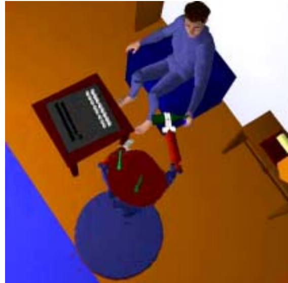
Figure 7: The motion planner must plan a position of the robot and of the pouring gesture that look natural and are safe for the human.

humans. These requirements translate into an efficient motion planning system with permanent collision checking of the robot whole body with the human body using the notion of safe distance and models of human interactions related to interaction distances, object manipulation, human motion and human communication. Work is in progress for experimenting these concepts in the motion planning system MOVE 3D.