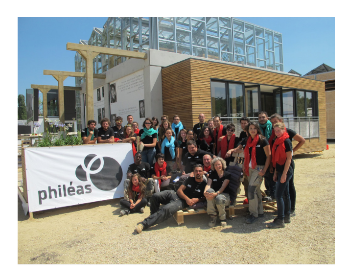
Figure 2. Solar Decathlon Europe 2014. Team Atlantic Challenge with students of the School of Architecture and two Schools of Engineeing.

Thus, we can question the way in which experiences "outside the walls" - whether they are part of an educational framework or "all against" - shape the trajectories of architecture students and endow them with a specific spatial capital. The figure of the "pass-through" would make it possible to explore the type of borders (disciplinary, scalar, social but also more symbolic, etc.) that the students collide with, cross or from which they free themselves during these experiences. It is a question of understanding how the students foster the acquisition of knowledge, know-how and interpersonal skills, in particular between peers. The concept of "space defector" (like the "class defector") might help as a possible characterization of these future architects.