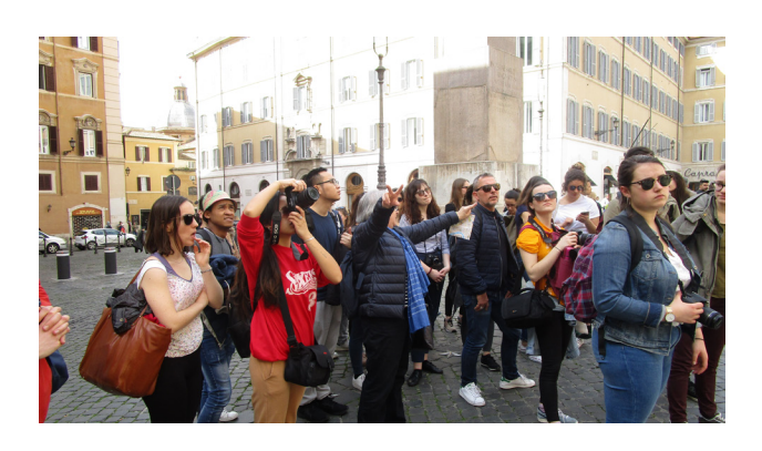
Figure 1. Study trip to Rome of second year students.

"Outside the walls" offers specific space-times of socialization which tend to unframe the relationship between students and teachers, but also between peers. Study trips in full promotion (to Paris in the first year, to Rome in the second year) or partial (to a European capital in the third year), field surveys during tutorials in sociology or on-site immersion during project workshops, but also more individual experiences such as internships, are all opportunities to socialize with architecture outside of school.