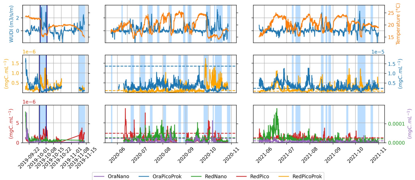
Figure 1. Time series of (a) Wind-driven Upwelling/Downwelling Index (WUDI, \text{m}^3 \cdot \text{s}^{-1} \cdot \text{m}^{-1} ) and temperature ( ^{\circ}\text{C} ) as well as (b and c) phytoplankton biomasses ( \mu\text{gC} \cdot \text{mL}^{-1} ) monitored at the SSL@MM coastal station. The blue rectangles correspond to the 20 studied SWUEs. The event shown in Figure 2 is bounded by a dark blue box. The horizontal dashed colored lines correspond to the median biomasses observed during the spring bloom (except for 2019, not available) for each PFG (according to the color code).

until they were analyzed in a laboratory using a Technicon Autoanalyser® (SEAL Analytical) as in Tréguer and Le Corre (1975).