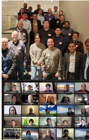
Image 1. Participants of the LS4P-II hybrid kickoff workshop