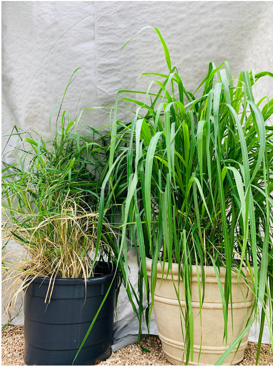
Fig. 2 Morphotypes of Guinea grass in North America. Guinea grass ( M. maximus ) grows in dense clumps with a high density of plants connected through very short rhizomes. Guinea grass culms are erect and cylindrical with either glabrous internodes or hairy internodes. The culms are sometimes branched, and this branching may develop into stoloniferous growth, where the leaf and root tissue will form vertically as the culm begins laying over. These stoloniferous nodes often reproduce one to three individuals per culm (Alves, Xavier 1986). Short and tall forms of Guinea grass are differentiated by their morphological characteristics of the leaves and stems. They can grow sympatrically, but large Guinea grass favors wetter shadier environments, while short form Guinea grass can grow in mesic and open areas. Short form Guinea grass generally grows 1–2 m tall, while tall form Guinea grass grows 2–3 m in height in well-watered conditions (Photo 1). Leaves are highly variable with light green to bluish-green leaves which are linear, narrowly lanceolate and vary in size for the short form from 12 to 40 cm long, and 12 to 25 mm wide and large Guinea grass leaves can reach up to 60 cm long and 35 mm wide. Panicles for both short and tall Guinea grass are ovoid racemose and terminal from 15 to 65 cm long. Reddish-brown spikelets are oblong, rounded on the back, either glabrous or pubescent 3.5 mm long when mature (Alves, Xavier 1986). The ligule is membranous with a ciliate margin and is from 1 to 3 mm long (Wagner et al. 1999). Guinea grass is highly plastic in both its vegetative characteristics (size, color, hairiness) (Ellis 1988) and reproductive strategy (seed vs. vegetative (Rhodes et al. in prep. )), which has led to many morphotypes being described in its native range (Njarui et al. 2015).

wild populations, even in close proximity such as at Mpala, Kenya, and Brownsville, Texas, indicates a level of reproductive isolation, perhaps from apomixis or from differing ploidy levels (Fig. 2). However, several intermediate size classes exist as products of breeding programs (Jank et al. 2001; Sukhchain 2010; Usberti-Filho et al. 2002).