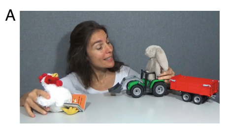
Ko rabbit wants to read ka book.