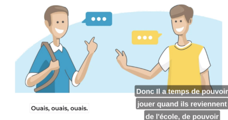
Figure 2: Screenshot of generated video for an interruption.