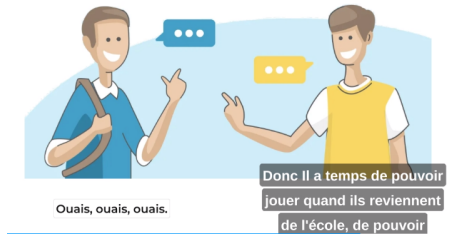
Figure 2: Screenshot of generated video for an interruption.