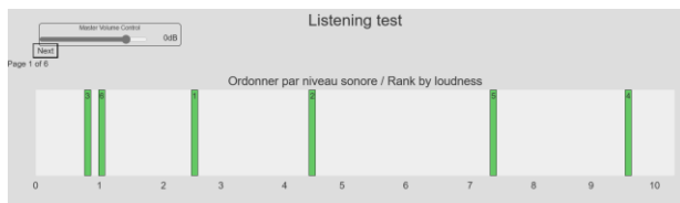
Figure 5. Listening test interface: Ranking by timbre for the ABCD set (top) and ranking by loudness for the Bilbao set (bottom).