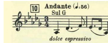
Figure 1. Excerpt from the Glazunov concerto

We recorded a semi-professional violinist in a large seminar room, playing a short excerpt from the Glazunov concerto (Fig. 1) on the ten violins described above. The position of the player was kept constant relative to the microphone (DPA 2006C) throughout the session, at a distance that had been adjusted at the beginning of the session to obtain pleasant recordings.