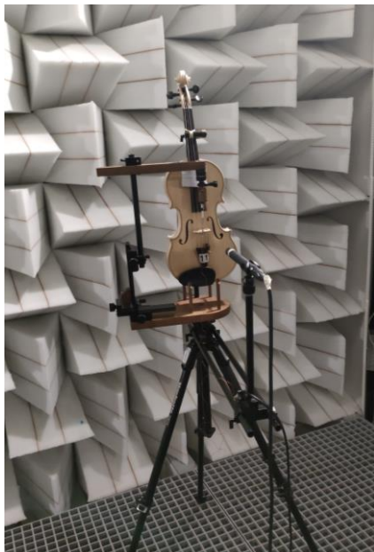
Figure 4. Radiation measurement rig

This hybrid synthesis allows to drive different virtual violins by the same realistic forcing waveform (measured during real playing) so that sound differences can be compared with no complications arising from variations in playing.