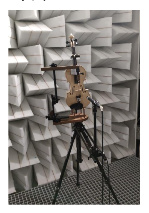
Figure 4. Radiation measurement rig

This hybrid synthesis allows to drive different virtual violins by the same realistic forcing waveform (measured during real playing) so that sound differences can be compared with no complications arising from variations in playing.