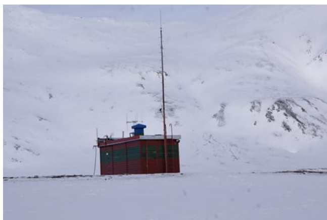
715 Figure 1: Overview of the instruments placed atop Gruvebadet atmospheric laboratory roof.