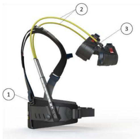
Figure 1. Description of Hapo MS™ exoskeleton model (Le Tellier et al., 2021 [37]). (1) harness; (2) springs; (3) double-interface.

This exoskeleton is composed of a harness that is worn on the back with an attachment that encompasses the elbow and is connected to the harness via a spring (Figure 1). The stiffness of the springs can be 4 kg for light assistance or 6 kg for heavy assistance, and this can be modified to suit the type of work and the user's morphology. The 4 kg (or 6 kg) assistance allows the extremity of the spring to be held at 90°, with respect to the shoulder level on the harness, with two weights of 2 kg (or 3 kg) at each extremity. In the current study, an assistance of 4 kg has been used given the fact that most movements were below 90° of arm flexion. The exoskeleton was adjusted to each participant through several adjustable attachments (waist belt, horizontal starting point of the tube integrating the spring at back level, length of the spring through telescopic tube, chest belt).