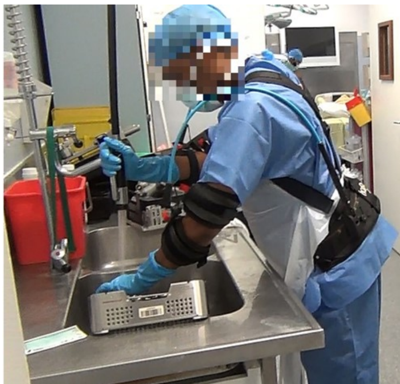
Figure 2. Healthcare worker wearing the exoskeleton during the task of cleaning surgical tools.

First, the subject was taken to a separate room where the experimenter was able to place the six EMG electrodes on the subject's upper limbs and trunk. The subject's maximum voluntary contractions (MVC) was then collected over three trials [43]. After this preparation step, the subject performed a tool cleaning task, in one of the two conditions, with and without exoskeleton, in a randomised order (Figure 2). The task lasted between 5 and 20 min to complete, depending on the quantity and nature of the instruments that needed to be cleaned. If the subject performed another tool cleaning task immediately afterwards, we did not register a new MVC and we performed the second condition directly (with or without the exoskeleton depending on the condition that was already done). If it was not possible to record successively the second condition, he or she was completely unequipped. In that case, the second condition was recorded later in the day and the MVC was collected a second time before this condition.