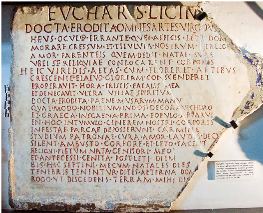
fig. 1 – Metrical Epitaph for Eucharis.