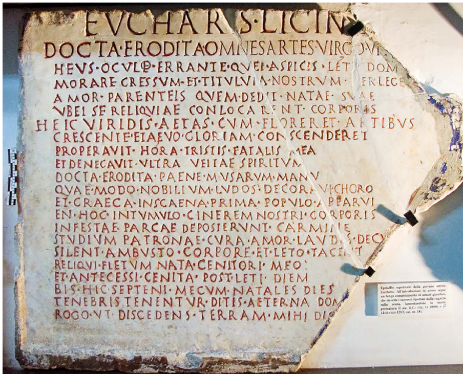
fig. 1 – Metrical Epitaph for Eucharis (Image: M. Limón).

immatura fecit ut faceret infelix parens (CLE 165) – ‘what the daughter should have done for her parents, an immature death made the unfortunate parents do for their daughter’. Ideally, this idea should be used in the case of the death of children and young people, but the fact is that one is never old enough to die, and we find it also in the case of the death of adults. To express the grief of premature death, many inscriptions have resorted to the imitation of Vergilius ( Aen. 6, 429) abstulit atra dies et funere mersit acerbo , the end of the famous passage dedicated to the premature dead in the description of hell and which, referring to the death in combat of the young Pallas repeated in Aen. 11, 28. This is the Virgilian verse most often imitated – often as a literal or quasi-literal quotation – in the Carrnina Latina Epigraphica 12 .