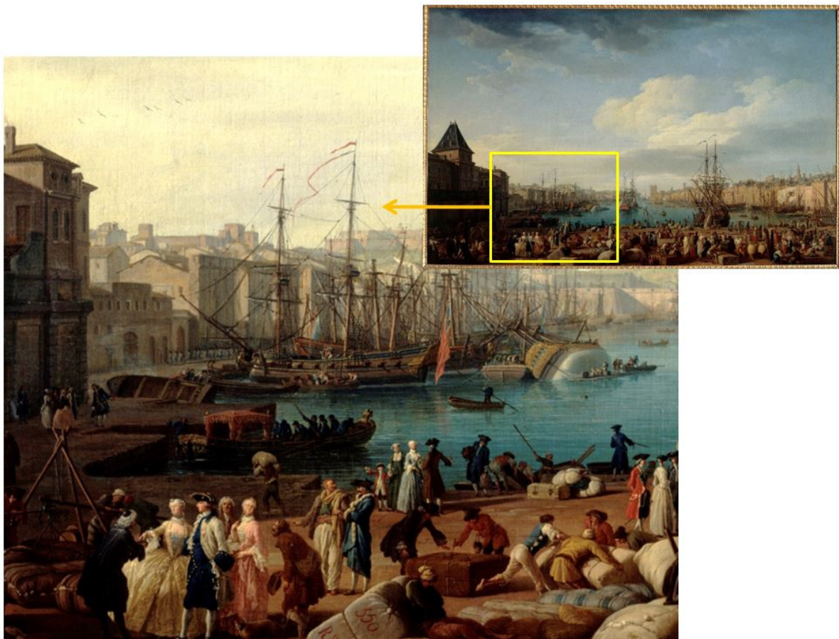
Figure 1. Top right, view of the port of Marseilles, seen from the Pavillon de l’Horloge du Parc within the port (‘L’intérieur du port de Marseille, vu du pavillon de l’horloge du Parc’), painting by Claude-Joseph Vernet, 1754, conserved in the Musée National de la Marine in Paris (France). Below left, a detail showing, on the right, a vessel careened to allow workers, onboard small boats, to scrape the fouling from the hull.

Why did the introduction fail? The ‘yellow mussel’ was immediately perceived as exotic, and its introduction vector was identified as the fouling on the hulls of vessels arriving in the port of Marseilles [45–47]. Darluc [46] mentions that the mussels were thrown on the rocks below the citadels. Before leaving a port for a new voyage, the hull was sometimes cleaned (careening) of the largest fouling organisms, whose presence would slow down the boat. This ship maintenance, still practised nowadays, though less frequently because of the use of antifouling paints, was in use in the 18th century. That was also the case in the port of Marseilles, as illustrated in a painting by Vernet (Figure 1), where the citadels can be identified as Fort-Saint-Jean and Fort-Saint-Nicolas. These still-standing forts, which frame the entrance of the port, were erected by the king of France, Louis XIV ‘the Sun King’, between 1660 and 1664, not to protect the city from enemy fleets but to subdue the rebellious spirit of its inhabitants who, after almost 21 centuries of independence (an independence which was, according to historians, relative and open to discussion), had recently been incorporated into the Kingdom of France [77] (Figure 2).