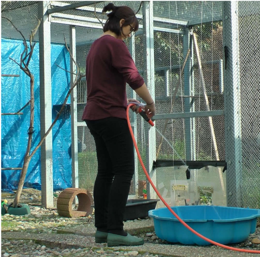
FIGURE 1 Illustration of the experimental setup.