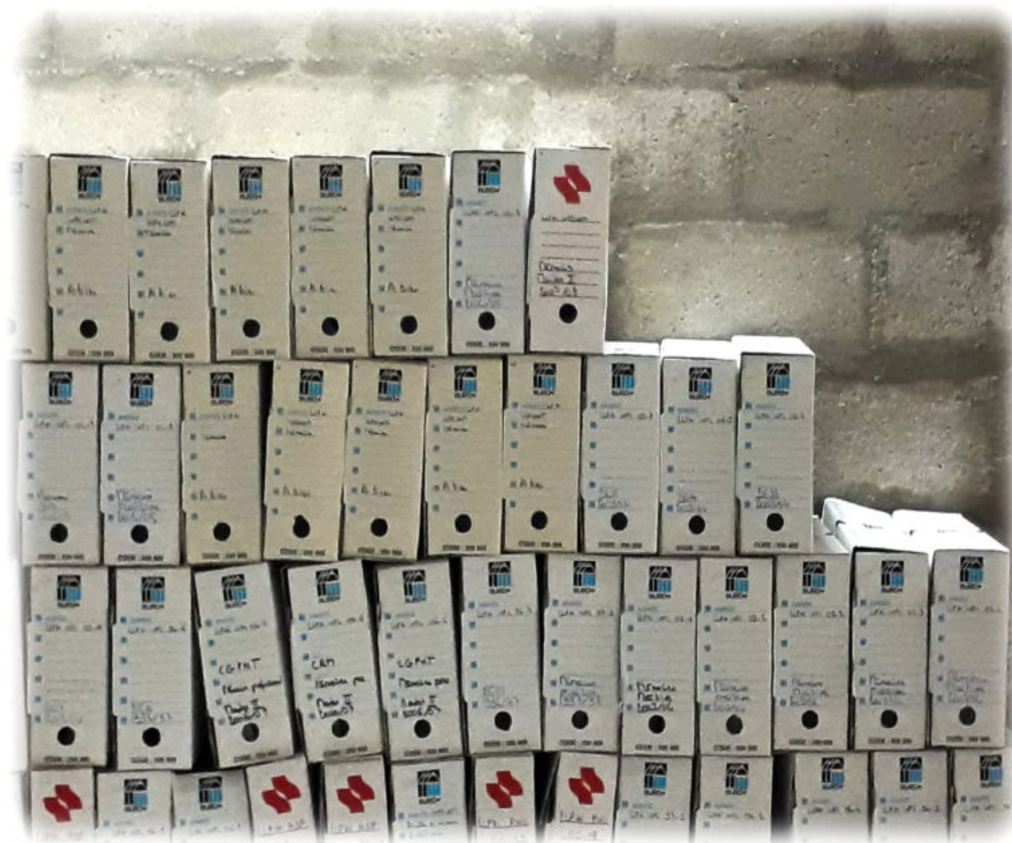
Figure 1. Archive boxes as they appear in Nanterre university archive room