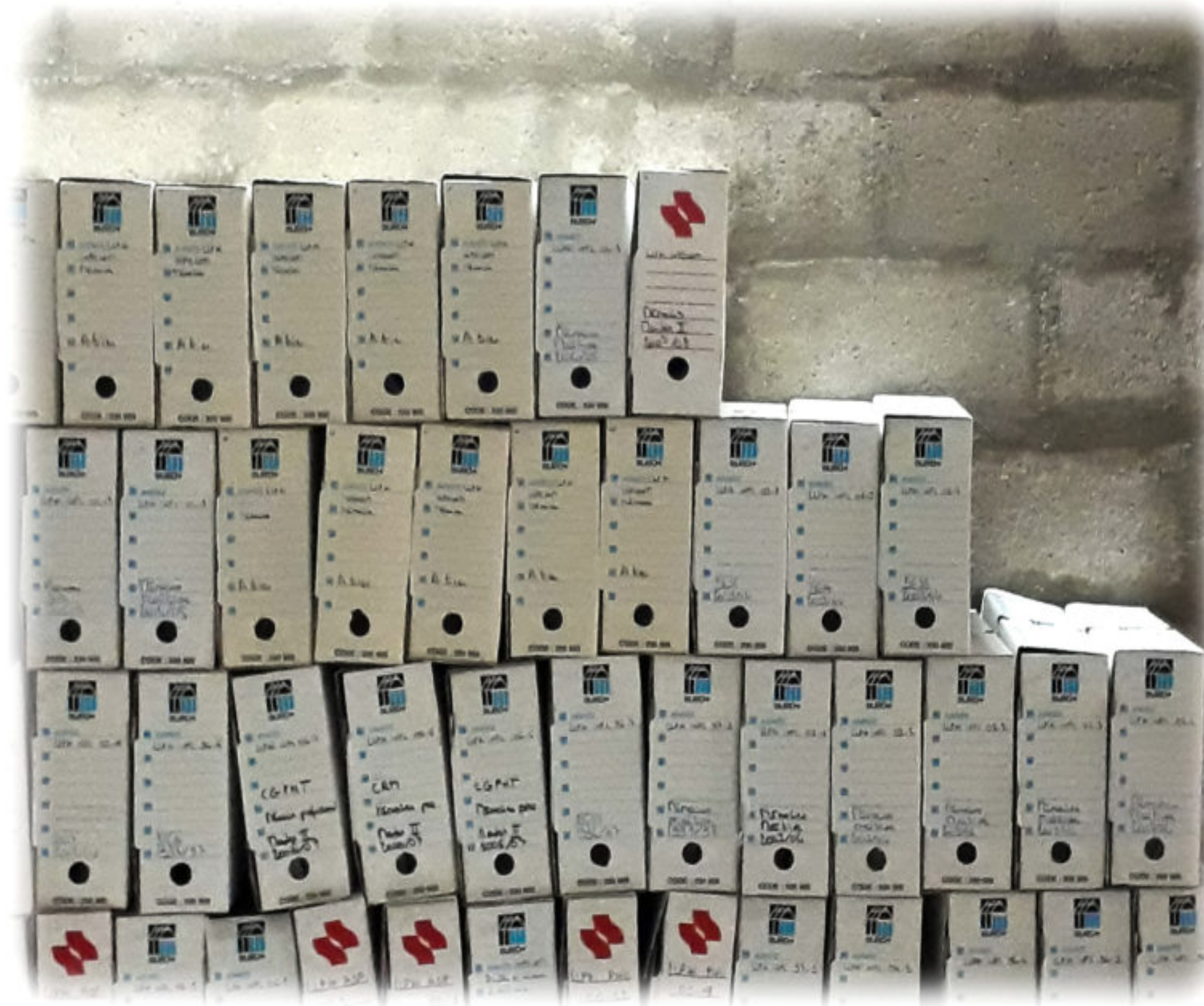
Figure 1. Archive boxes as they appear in Nanterre university archive room