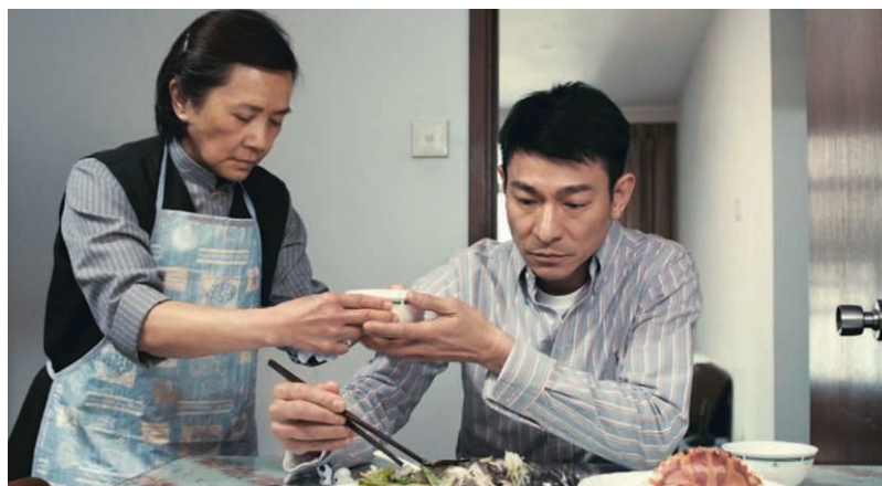
Figure 2. Roger takes Ah Tao’s service for granted and does not bother to glance at her as she provides his meal in A Simple Life . Frame grab

In A Simple Life , Roger, too, merely glances at the faithful servant he takes for granted before Ah Tao’s stroke separates them. In an early scene, Ah Tao serves Roger his meal of steamed fish, crab, and seasonal vegetables, which she carefully selected at the local wet market, at the kitchen table. Roger takes her service for granted and does not bother to look at her as she provides his meal.