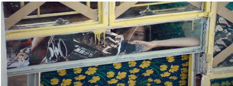
Figure 7. Ting Ting artfully uses newspaper and magazine clippings to obscure the view from the windows in Bends . Frame grab

Ann Hui and Flora Lau use ‘empty’ shots of spaces devoid of human inhabitants to comment on loss, emptiness, and the melancholy at the heart of A Simple Life and