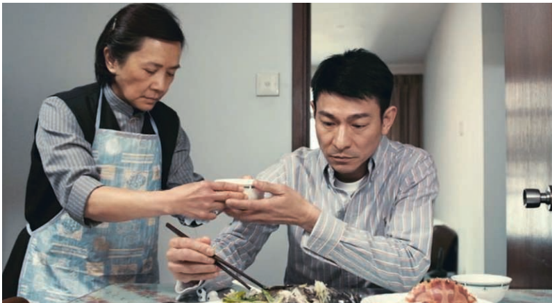
Figure 2. Roger takes Ah Tao’s service for granted and does not bother to glance at her as she provides his meal in A Simple Life.

In A Simple Life , Roger, too, merely glances at the faithful servant he takes for granted before Ah Tao’s stroke separates them. In an early scene, Ah Tao serves Roger his meal of steamed fish, crab, and seasonal vegetables, which she carefully selected at the local wet market, at the kitchen table. Roger takes her service for granted and does not bother to look at her as she provides his meal.