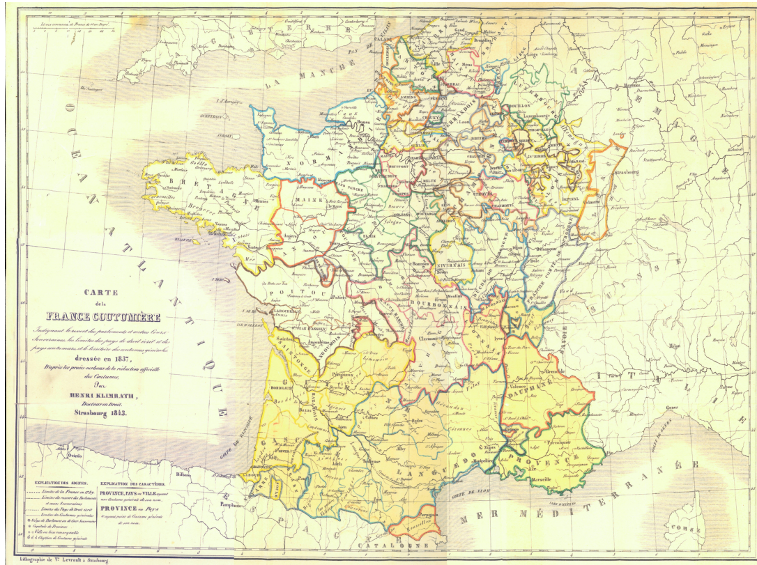
Figure A.1. Customary Boundaries based on Klimrath (1843)

Notes. This figure reproduces Klimrath's (1843) original map of customary boundaries. It is available from Fourniel and Vendrand-Voyer (2017).