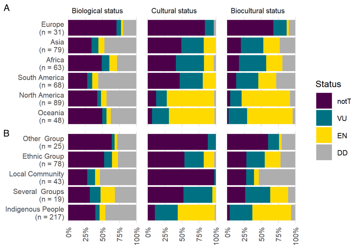
Fig. 3. Biological, cultural, and biocultural status of 385 culturally important species. (A) Distribution across continents; (B) Distribution across sociocultural group type. Colors depict status.