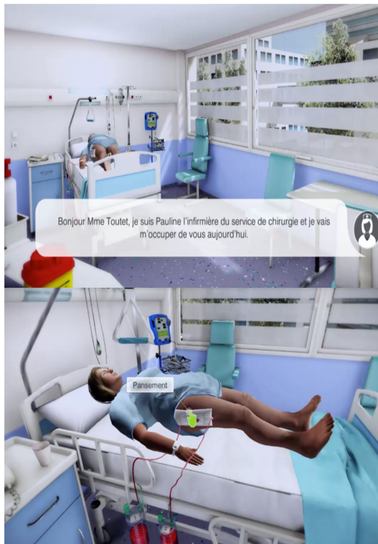
Fig. 1 Screenshots of LabForGames Warning

The criteria for the detailed scoring had previously been established by the pedagogical team. The participant's clinical examination actions (checking arterial pressure, pain, etc.) and his/her decision (to call the physician, etc.) were assigned positive, negative or neutral points depending on the steps of the case. Moreover, positive or negative points were assigned to the quality of communication during the SBAR tool part of the game. The detailed score of case 1 is presented in Additional file 2.