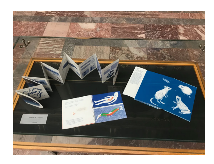
FIGURE 2 Presentation of artistic scientific books presenting different model organisms.

Arts was also included throughout the meeting as two collaborations had been initiated early on. Frist with a scientific illustrator enabling us to build a real visual identity for the meeting (Figure 1) and second with an art's school in Strasbourg, for a partnership