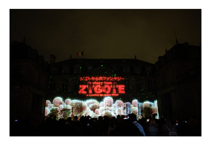
FIGURE 4 Picture of the opening of the video mapping event.

ions) on Wiley Online Library for rules of use; OA articles are governed by the applicable Creative Commons