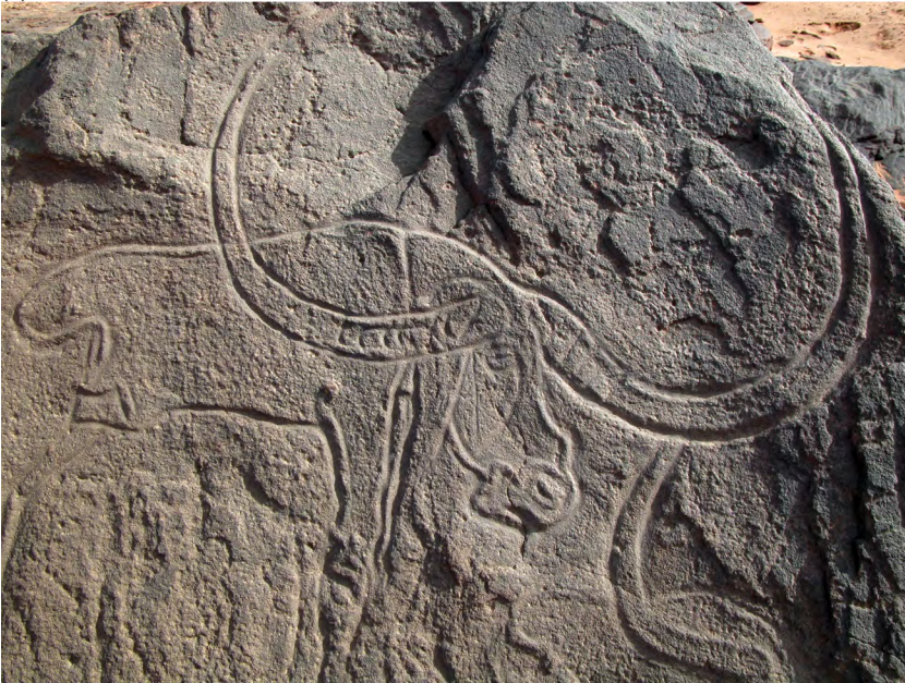
Figure 2.2 In rocky massifs in the Sahara, petroglyphs (engravings in the rock) of animal species are quite widespread. This rock art was made when the Sahara was covered by savannas or steppes, and thus shows many species that are now only known from the Sahel or East Africa. Among these are depictions of Syncerus (or Pelorovis ) antiquus , which is now extinct but was once widespread. (a) S. antiquus from I-n-Habeter, Mesāk, Libya. (b) Rock engraving of S. antiquus from Tilizzāyen, Mesāk, Libya.