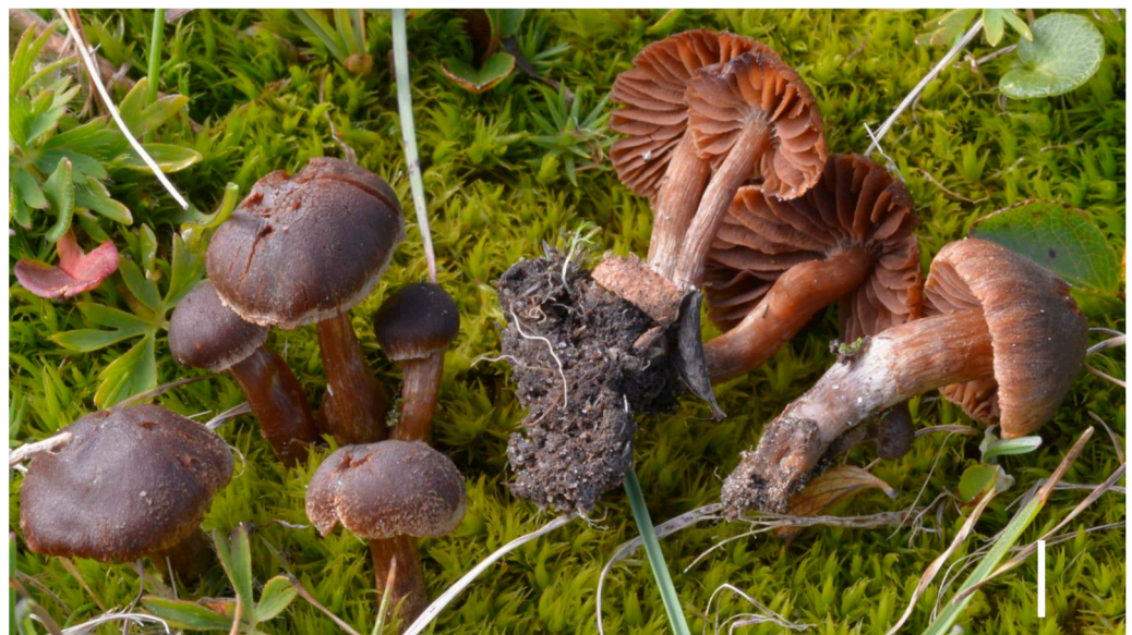
Figure 5. Cortinarius caesionigrellus TR gmb 01247, basidiomata in situ. Bar: 10 mm.

Cortinarius caesionigrellus Lamoure, Trav. Sci. Parc Natl. Vanoise 9: 82 (1978) (Figure 5).