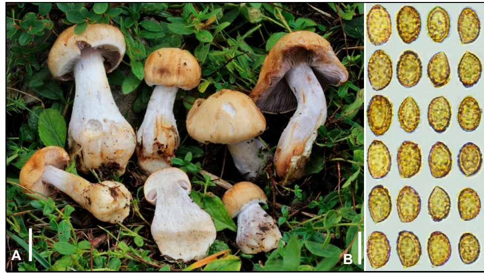
Figure 6. Thaxterogaster dovrensis (LY FA4340). (A) Basidiomata in situ. (B) Basidiospores. Bar: 10 mm (A), 10 \mu m (B).

Thaxterogaster dovrensis (Brandrud) Bellanger, comb. & stat nov. MycoBank MB849755 (Figure 6).