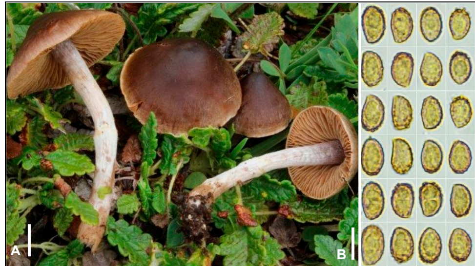
Figure 2. Cortinarius dryadophilus LY FA4330 T . (A) Basidiomata in situ. (B) Basidiospores. Bar: 10 mm (A), 10 µm (B).

Cortinarius dryadophilus Armada, Bellanger & P.-A. Moreau, sp. nov. MycoBank MB849751. (Figure 2A,B).