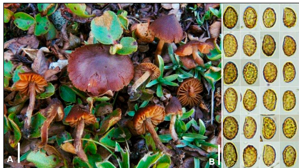
Figure 4. Cortinarius saniosopygmaeus LY FA1724 T . (A) Basidiomata in situ. (B) Basidiospores. Bar: 10 mm (A), 10 µm (B).

Cortinarius saniosopygmaeus Armada, Bellanger & P.-A. Moreau, sp. nov. MycoBank MB849753. (Figure 4A,B)