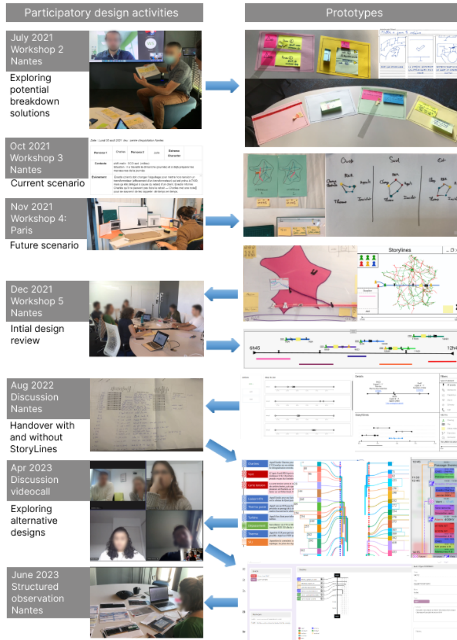
Fig. 2. Participatory design activities alternated between design sessions with operators (left column) and prototypes created by operators and researchers (right column) over a period of approximately two years.