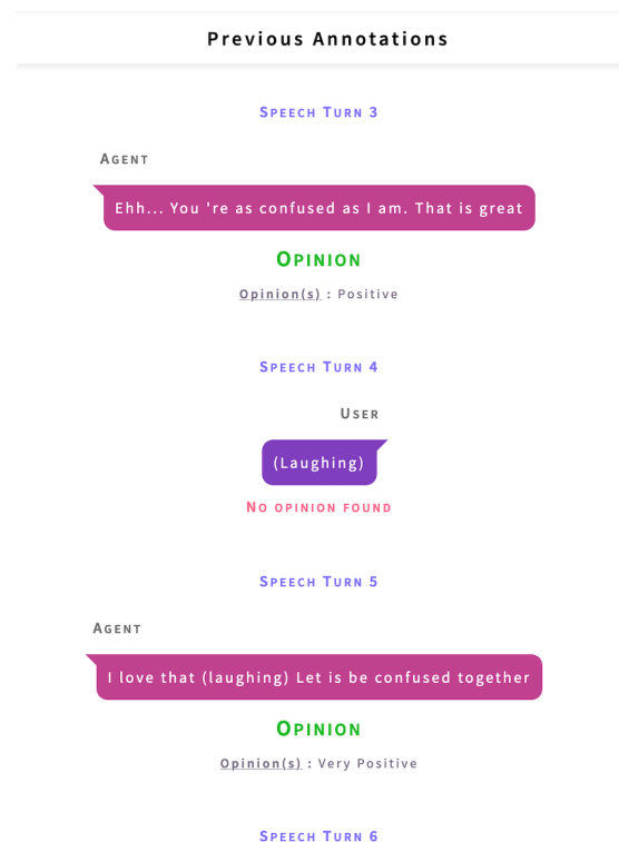
Figure 2: Example of an annotation's visualization

We collected the annotation using a schema and a platform firstly developed by Langlet et al. (2017) on another task and corpus that we improved in several ways: the schema we crafted is a series of questions designed to reduce the cognitive load of the annotator, we added the audio content to the textual content in order to give more information to the workers, we created a visualization platform allowing the annotator and ourselves to look at their annotations, we sent feedback to the annotators in order to help them improve the quality of