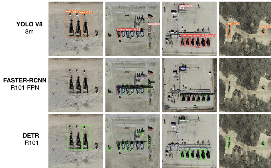
Figure 2: Detection results of YOLO, FASTER-RCNN, DETR on 4 different images.

Results tend to show a better general performance for the YOLO model, with an average accuracy of over 90% (comparisons of algorithms detection illustrated in Figure 2 compare to 85,5% for DETR and 48,8 for FASTER-RCNN. Through our tests, YOLO confirms its general ability to detect and recognize O&G infrastructures with a quite high reliability. However, certain parameters remain to be determined: