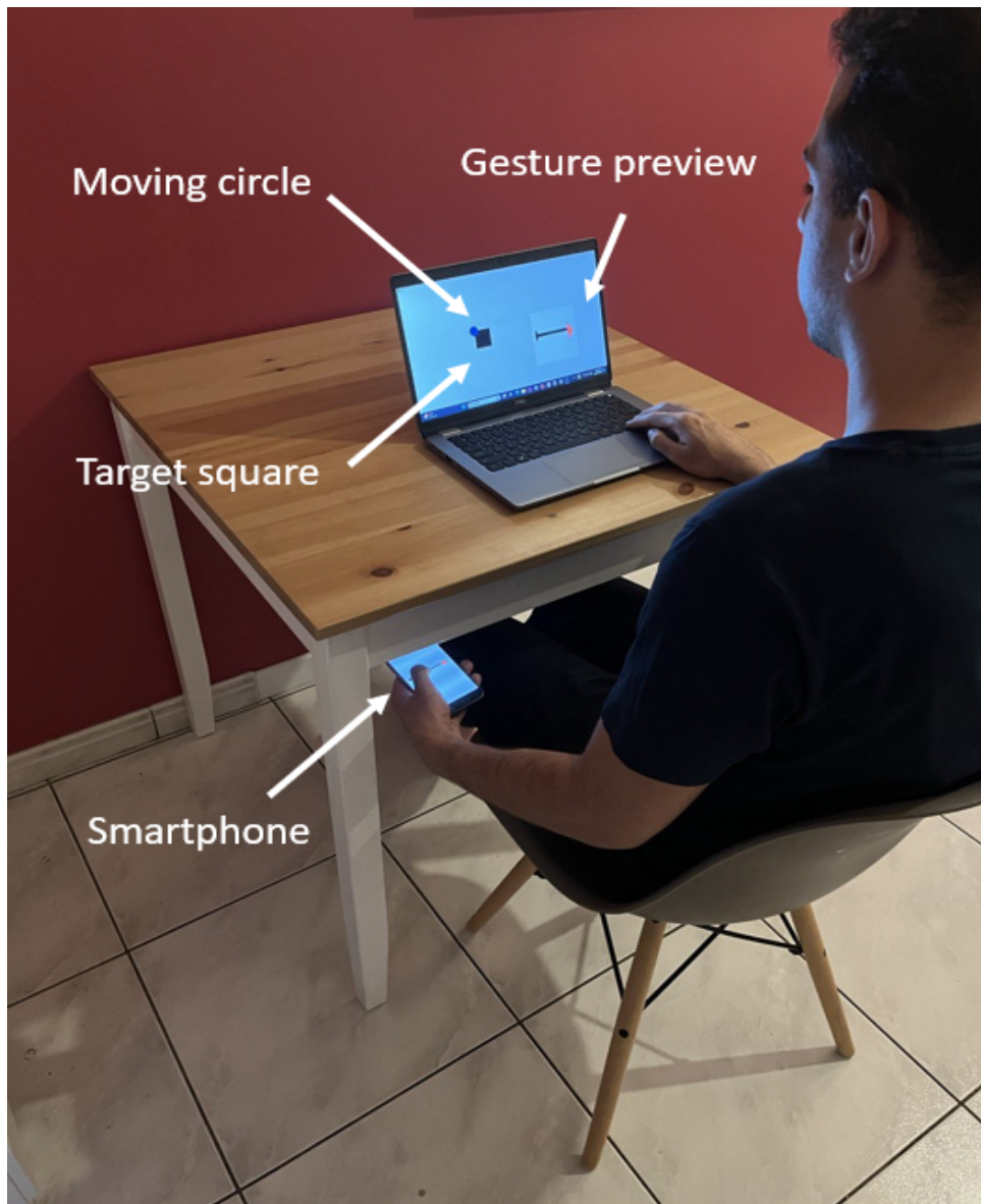
Fig. 2. The setup used for the experiment. The smartphone was held under the table to maintain eyes-free condition.