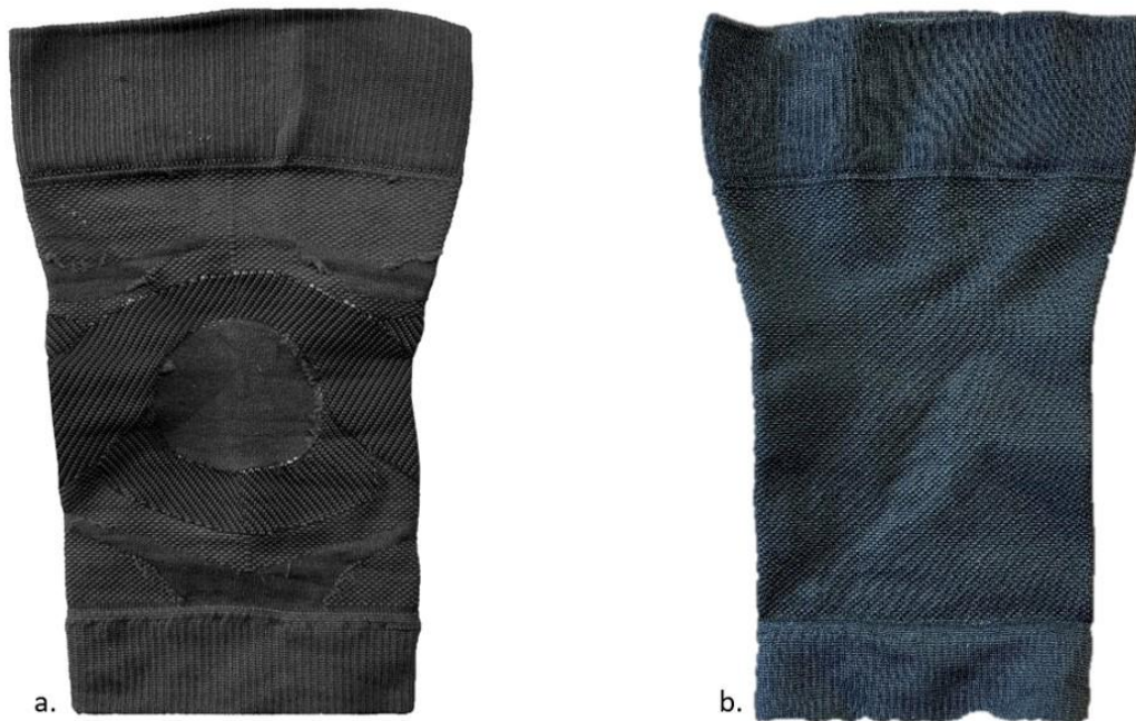
Fig. 5: Illustration of prophylactic orthosis (a) and control orthosis (b)

In future studies, it would be interesting to study the impact of this prophylactic orthosis, particularly during changes of direction or receptions. These movements are elements that athletes encounter and can increase the instability factor. This factor is even more important for athletes who have already had an ACL injury or reconstruction. The impact of orthotics on stability during this specific type of task has been discussed (Hanzlikova et al, 2019), but the orthotics studied had different characteristics than in this study. They had shown that the orthosis significantly influences the kinematics of the knee.