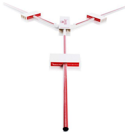
Fig. 1: Y-Balance Test

(PM) (Pliksy et al, 2009). This test has been shown to be reliable and reproducible for assessing postural balance of the lower limb (Baron, 2016; Picot et al, 2012; Plisky et al, 2009). In contrast it is essential to master the protocol and its standardization in order to obtain reliable and reproducible results. Indeed, a bad positioning of the foot, a bad placement of the hands or a too important number of passages can lead to measurement errors that can affect the results. According to several studies, it is necessary to perform 4 training trials in order to limit the learning factor during the test (Baron, 2016; Gribble et al, 2012; Olmsted et al, 2002).