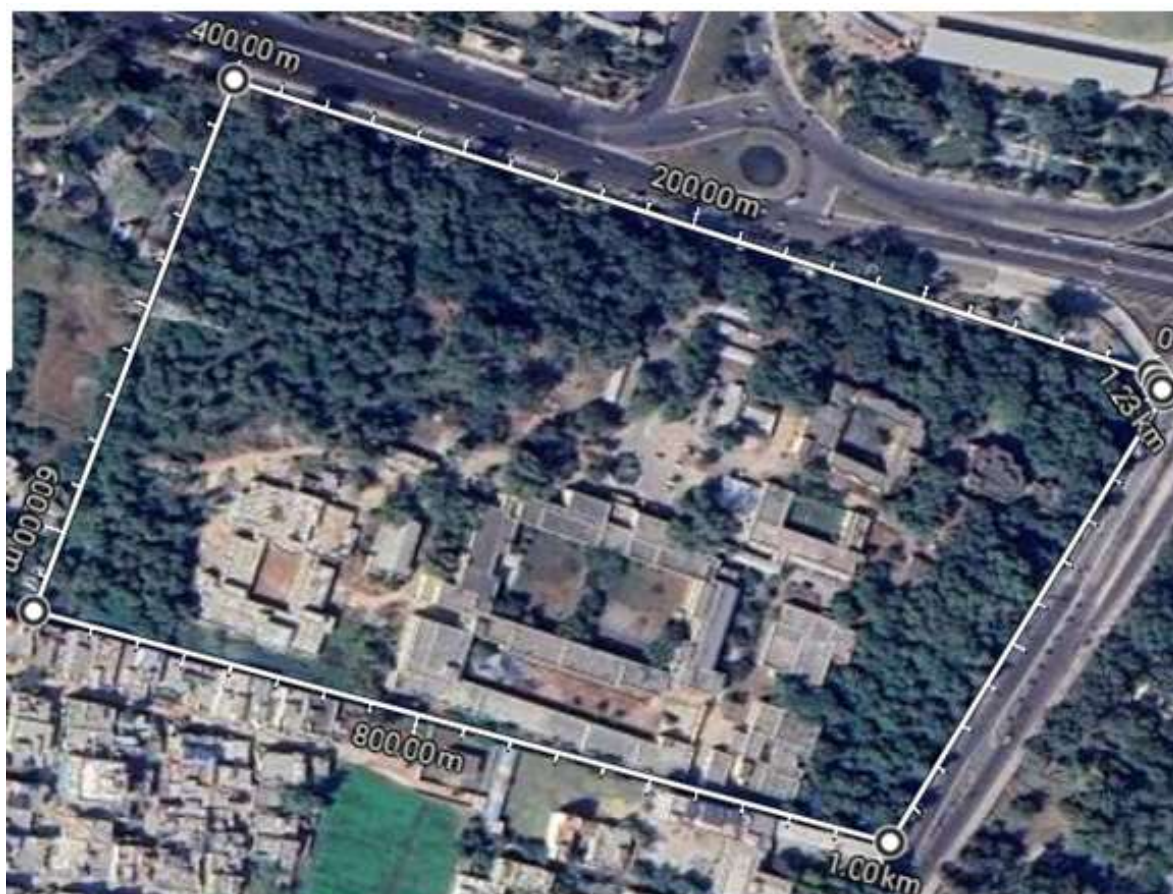
Fig. 1. Satellite map of Janki Devi Bajaj Govt. Girls College campus showing dense vegetation

Non-destructive method of biomass estimation was used to measure the GBH of individual trees on the campus. The girth of individual trees at breast height (1.37 m) was enumerated. The girth was measured using measuring tape. Above-ground biomass (AGB) and below-ground biomass (BGB) were calculated with the help of field measures of diameter at breast height (DBH) of the trees using allometric equations [31]. The below given equation is applicable for dry climates with annual rainfall <1500mm; which makes it ideal for the study area where annual rainfall is 728mm.