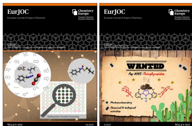
Figure 1. EurJOC Front Covers designed by the 2021 awardees.

performed via ruthenium-promoted heterogeneous catalysis. The efficiency of this methodology is demonstrated for the coupling of 2-aryl- N -heterocycles, in the presence of iron chloride as oxidant, for the study of the photophysical properties of the corresponding borane dimer complexes.