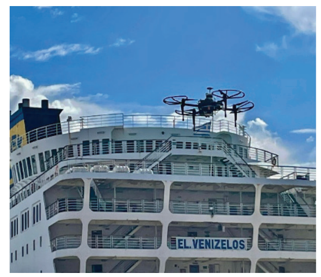
Image I: Unmanned Aerial Vehicle in a port area

ROVs (Image 2) are vehicles designed to function at the port's depths, which are equipped with high-resolution cameras, advanced sensors, and robotic arms. They are guided remotely by operators aboard a ship or from shore and can perform detailed inspections of ship hulls, port infrastructure, and even the seabed precisely and efficiently, revolutionising the way ports conduct underwater inspection, maintenance, and repair tasks.