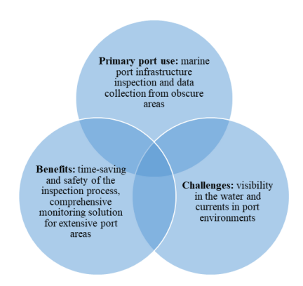
Figure 2: Benefits and challenges of ROV