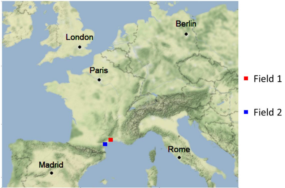
Fig. 2. Location of the two fields in southern France.