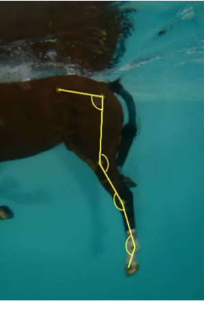
Figure 2. View of the 2nd and 5th camera at the same time. The anatomical points are from top to bottom: front limb (left): mid-length of scapular spine, shoulder, elbow, carpus, front fetlock and front foot. Hind limb (right): tuber coxae, hip, stifle, tarsus, hind fetlock and hind foot.