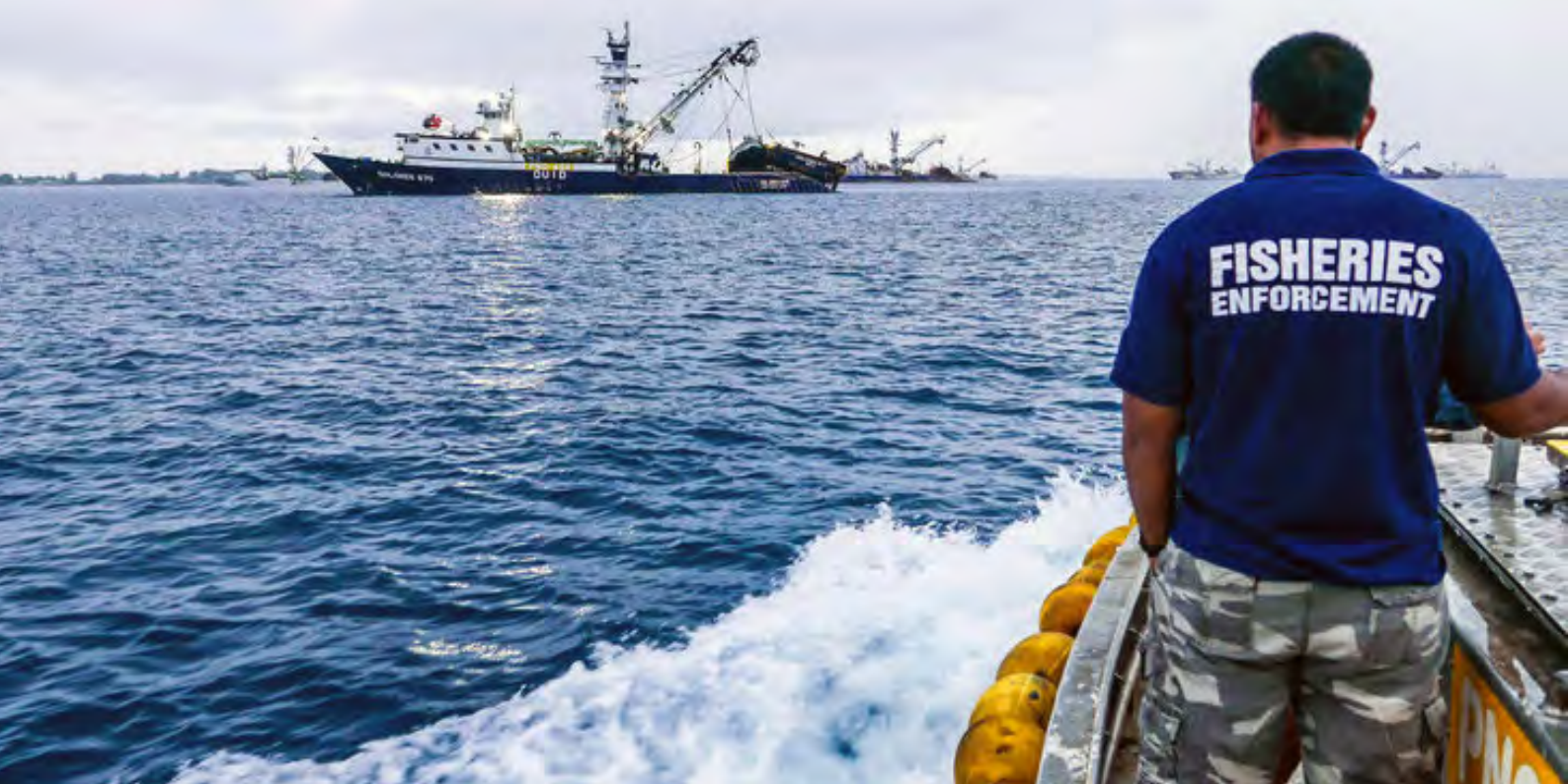
Regional-level agreements can help address climate-related shifts in fish stocks.